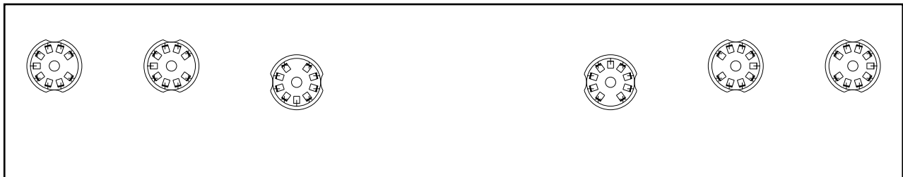
RIAA amp board